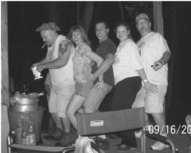
Having fun at the Fall MAR

* A full spread of pictures from the 2005 Fall MAR will be included in the 2005 Winter issue of the "PIG Pen" due out in December*