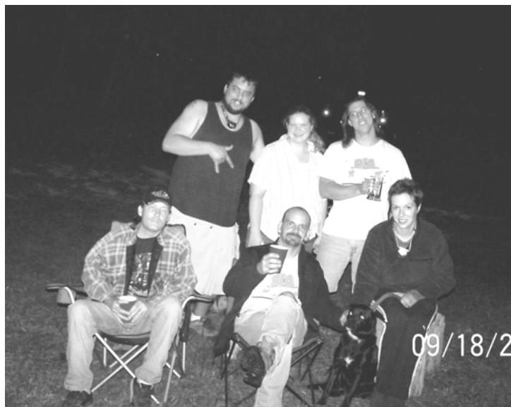
Some of the MAR hosts from PIG Grotto