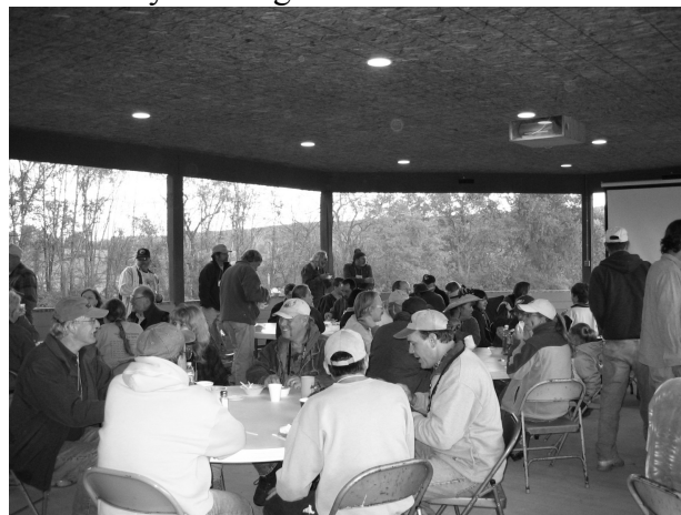
Cavers enjoying dinner at the Fall MAR