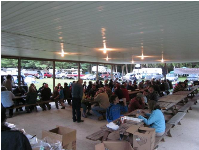
Clem BBQ Saturday evening

Those that arrived Friday were able to view the movie Sanctum under the pavilion if they desired. Cave trip sign-up sheets filled up quickly. Also, we had a nice bonfire going, and some Miller Lite and Yuengling. Woodward Cave management had suggested a different location for the bonfire, and it seemed to work well. Any noise and reveling was kept far away from the campground's seasonal campers. We appreciate that everyone obeyed the 10pm quiet hour restriction and also cleaned up after themselves.