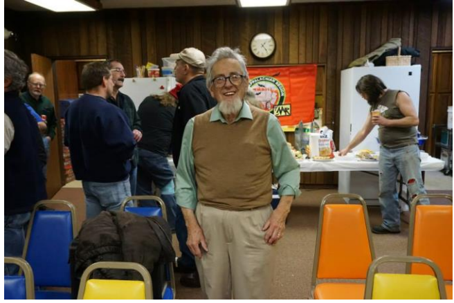
What a great smile!