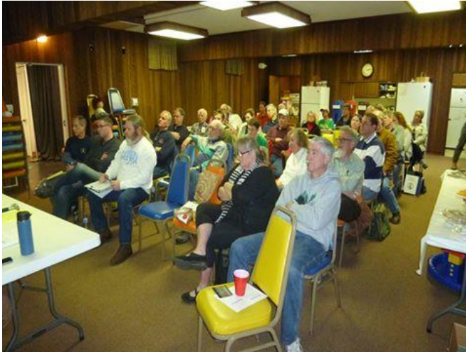
Good turnout for the meetings