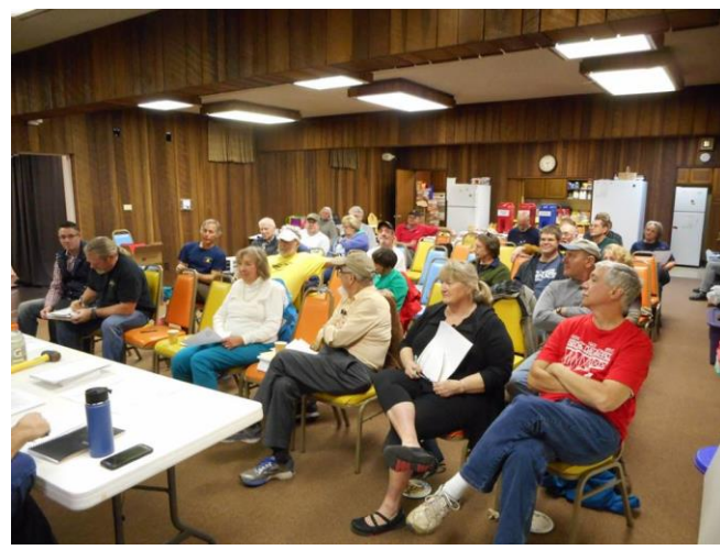
Good turnout for the meetings

Rupert Cave Preserve in McVeytown, Pennsylvania.