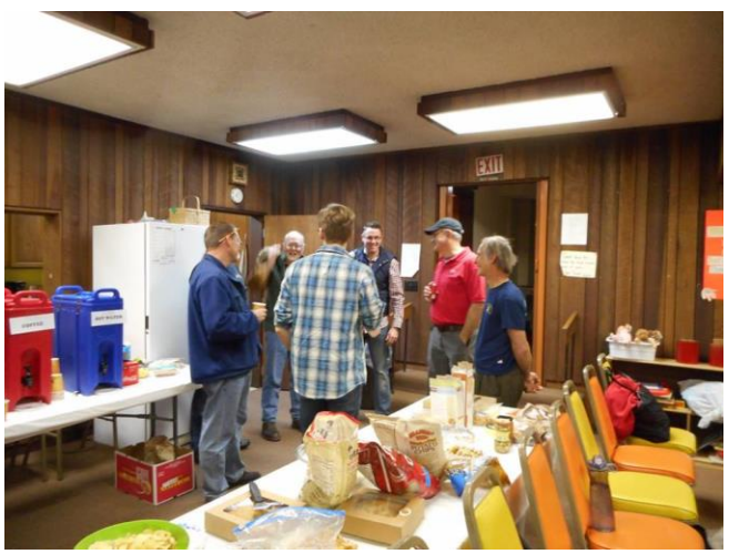
Taking a break between meetings