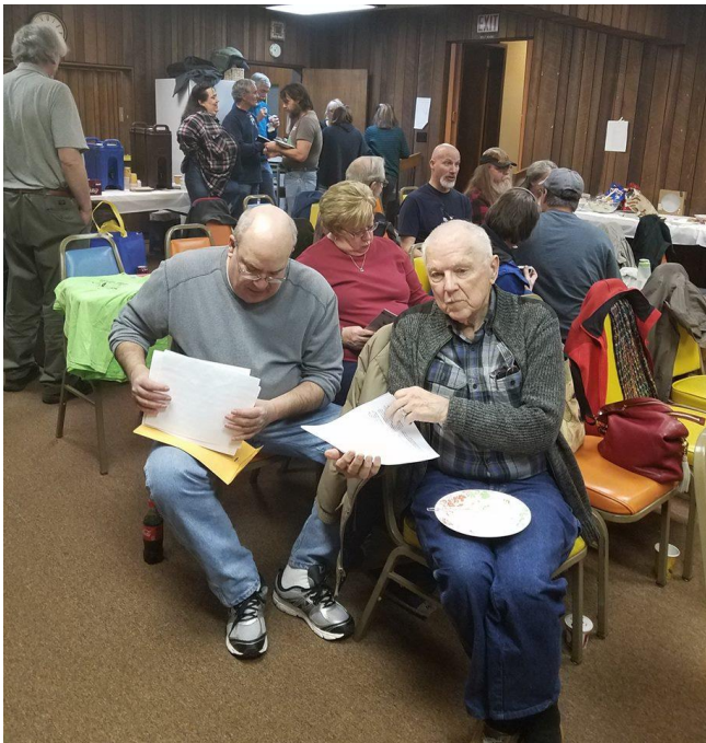
Taking a break between meetings

2018 Fall Field Meet: Nittany Grotto is hosting the fall MAR field meet at Rupert Cave Preserve on September 28-30, 2018.