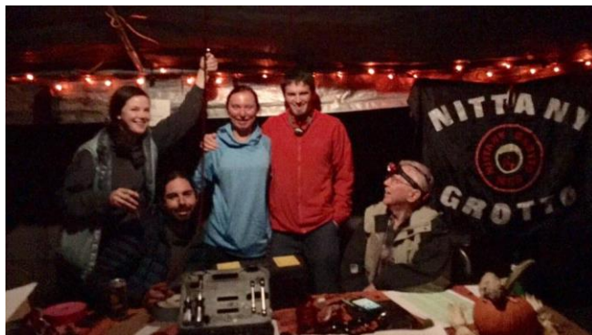
Registration