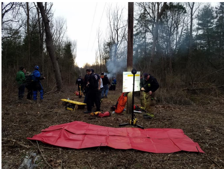
Figure 1: The area around the back entrance to the cave, near the patient

En-route I was advised by text that: "Okay I hear no injuries just people stuck", indicating that a full blown call out of personnel most likely would not be needed unless a "carry-out" became needed.