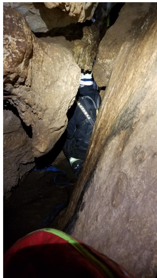
Figure 3: The crawlway before you get to the area of entrapment