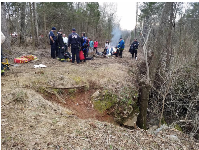
Figure 5: The back entrance sinkhole

Earl Suitor wvcaver216@gmail.com Tel: 703-431-2661.