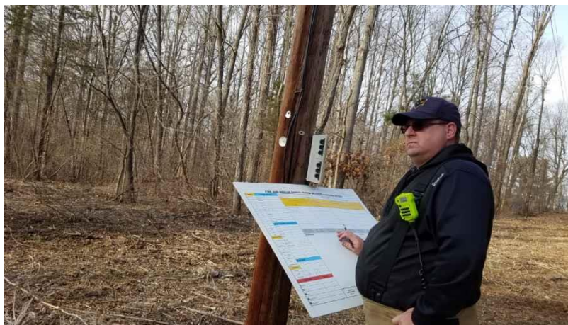
Figure 2: Entrance control