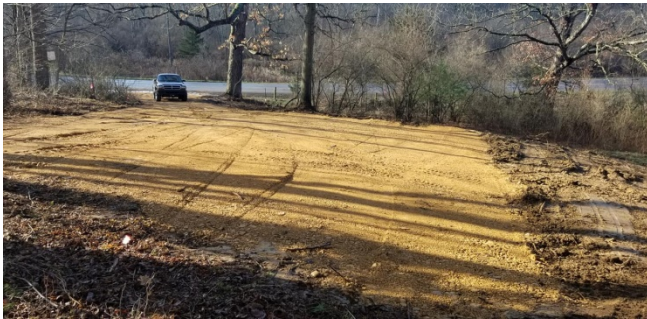
Parking area is roughed out and graded at Penn Aqua