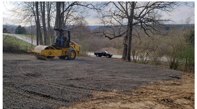
Gravel down and roller action at Penn Aqua