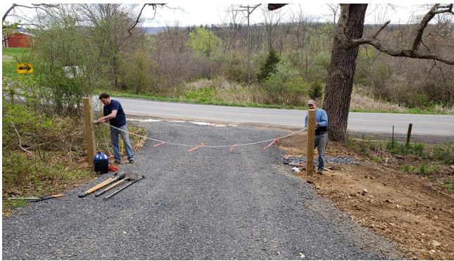
Installing the posts and cable across the driveway

PennDOT requires a driveway permit with any subdivision. The line of sight for the mandated driveway has to meet PennDOT requirements for approval, based on the speed limit and grade of the public road. Fortunately, an access point onto the property was established that met the requirements and the permit was issued in early November. And finally, the township required a backup septic system for the house on the remaining 5.75 acre property. The local septic official conducted a soil study and perk test. A back hoe was brought in to dig several holes and a location for a backup septic system was identified and approved.