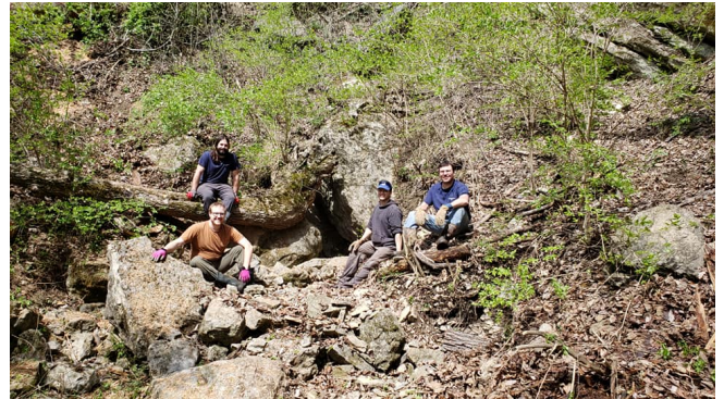
Got the entrance cleaned up!