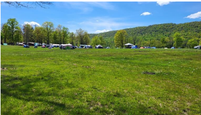
Beautiful weather for camping

It had been seven years since the Franklin County Grotto had hosted an MAR Meet in the spring (May 2016), and I wondered what challenges we might face if the FCG wanted to host the event again. However, at the January 16, 2023 grotto meeting, we decided to move forward and immediately a team formed and started making progress. Returning to Shade Gap, Huntingdon County, and Harpers Memorial Park (Shade Gap VFD) was our first choice because the site offers good camping, adequate parking, numerous pavilions, a stage, bathrooms and showers, and nearby caves.