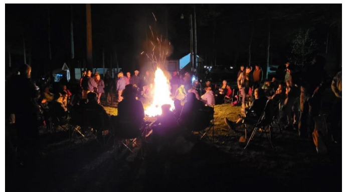
Great times around the bon fire

When the MAR Meet was held on May 5-7, 2023, we were fortunate to have good weather and an excellent turnout. With 214 people in attendance, this was the largest MAR-only event to date. Many folks registered early; (136 Adults, 2 children (6-12 years) and 5 (5 & under), but we also had 70 Adults and 1 child who registered on site. The previous largest MAR was held by Nittany Grotto in 1998 and was their 50 th anniversary celebration.