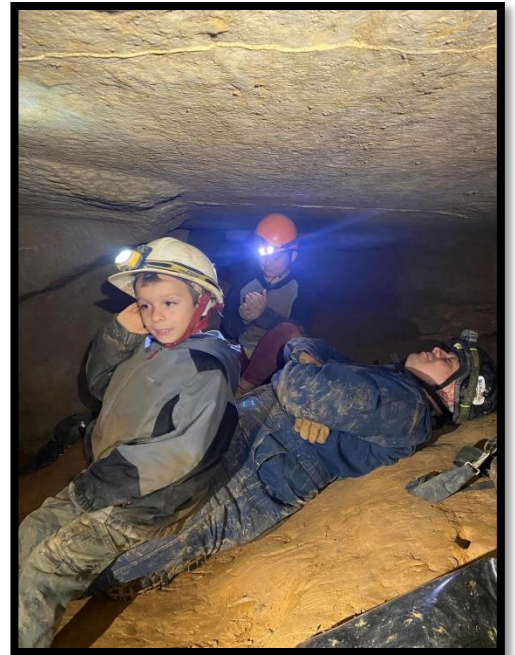
Taking a break in McClure Cave