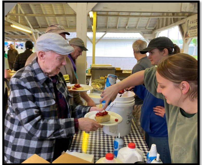
Serving up some strawberry shortcake for dessert. Yum!