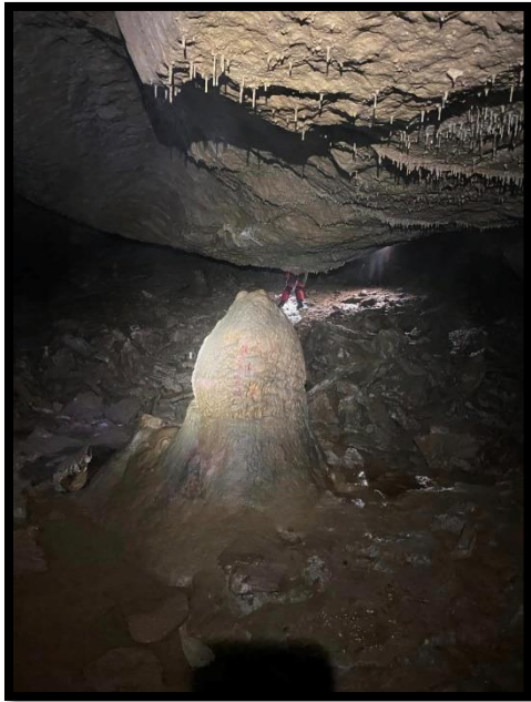
Formations in McClure Cave

The event featured both guided and non-guided cave trips. Participants explored McClure Cave and the historic Alexander Caverns, the crown jewel of Bald Eagle Grotto. Other cave trips included Maitland Cave, Kookan Cave, McAlisterville Cave, SeaWra Cave, Milroy Cave, and Womer Cave, all within 30-45 minutes of the campgrounds.