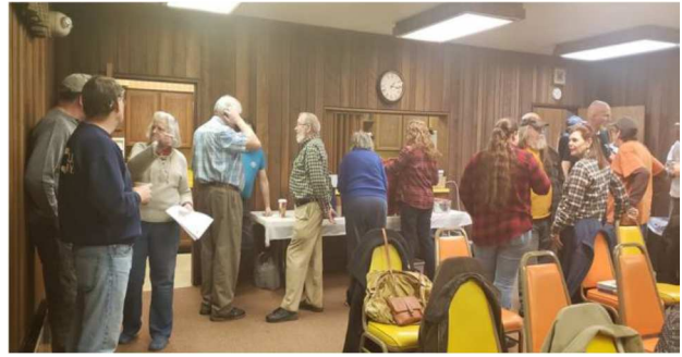
Catching up with fellow cavers