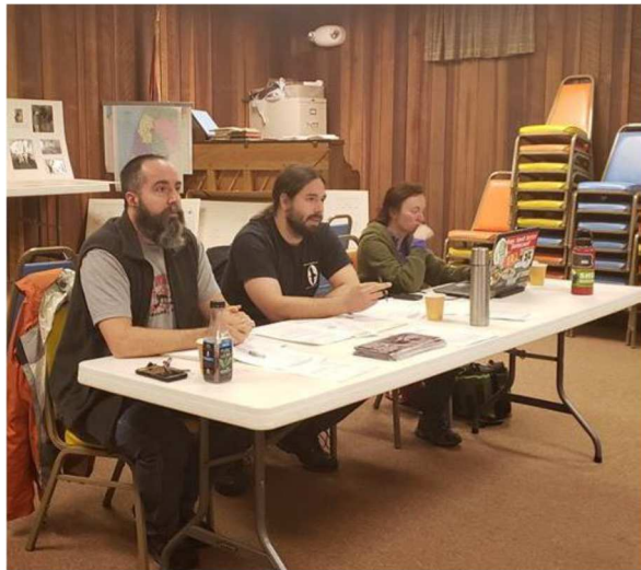
MAR Officers